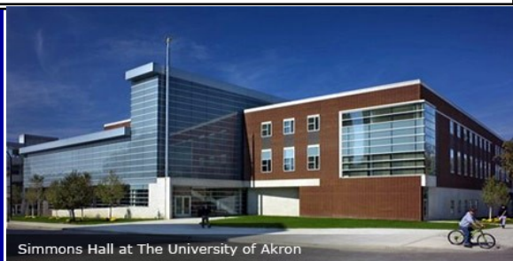
Simmons Hall at The University of Akron

Fall & Spring Office Hours: Monday- Friday 8 a.m.-5 p.m.